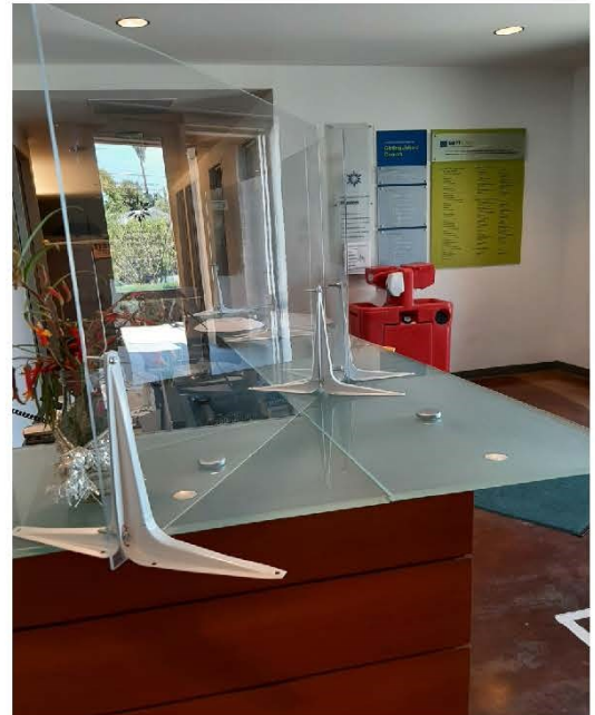
Family Resource Center Lobby